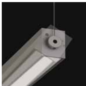
Rotazione 180° 180° Rotation